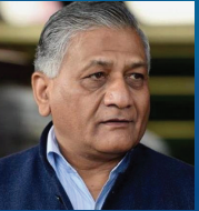
Gen. (Retd.) Dr. V.K Singh Minister of State for Road, Transport and Highways