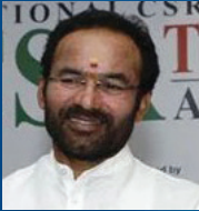
Sh. G Kishan Reddy Minister Of Tourism, Culture And Development Of North Eastern Region Of India