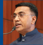
Dr. Pramod K Sawant Chief Minister of Goa