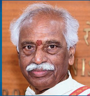
Sh. Bandaru Dattatraya Governor of Haryana