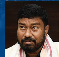
Sh. Rameshwar Teli Minister of State for Petroleum & Natural Gas