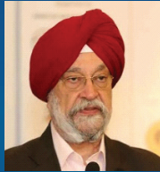
Sh. Hardeep S Puri Union Minister Of Petroleum & Natural Gas And Min. Of Housing & Urban Affairs