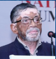
Sh. Santosh Gangwar Minister of State for Labour & Employment