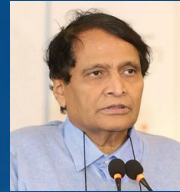
Sh. Suresh Prabhu Union Minister Of Commerce & Industry and Civil Aviation