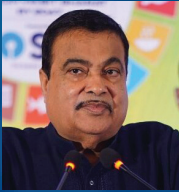
Sh. Nitin Gadkari Minister of Road Transport and Highways