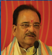
Sh. Ajay Bhatt Minister of State for Defence & Tourism