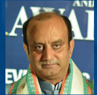
Dr. Sudhanshu Trivedi Member Of Parliament, Govt. Of India