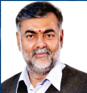
Sh. Prahlad Singh Patel Minister of State for Food Processing Industries & Jal Shakti