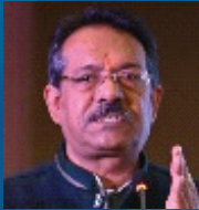
Sh. Harsh Malhotra Minister of State for Road, Transport and Highways