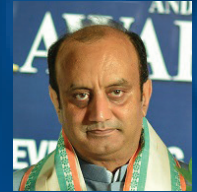
Dr. Sudhanshu Trivedi Member Of Parliament, Govt. Of India