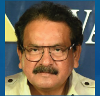
Sh. SPS Baghel Minister of State Min. of Health & Family Welfare