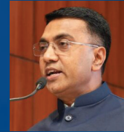
Dr. Pramod K Sawant Chief Minister of Goa